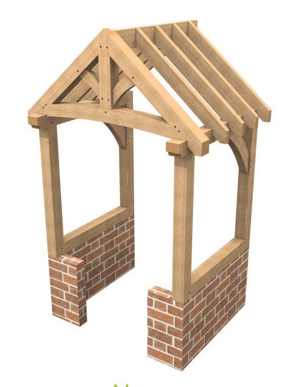
No. 12 d 1585 x w 1905 x h 3475 £2,950 + VAT