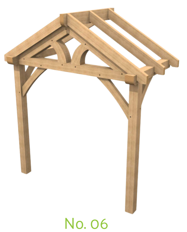
d 1200 x w 2430 x h 3000 f2,250 + VAT