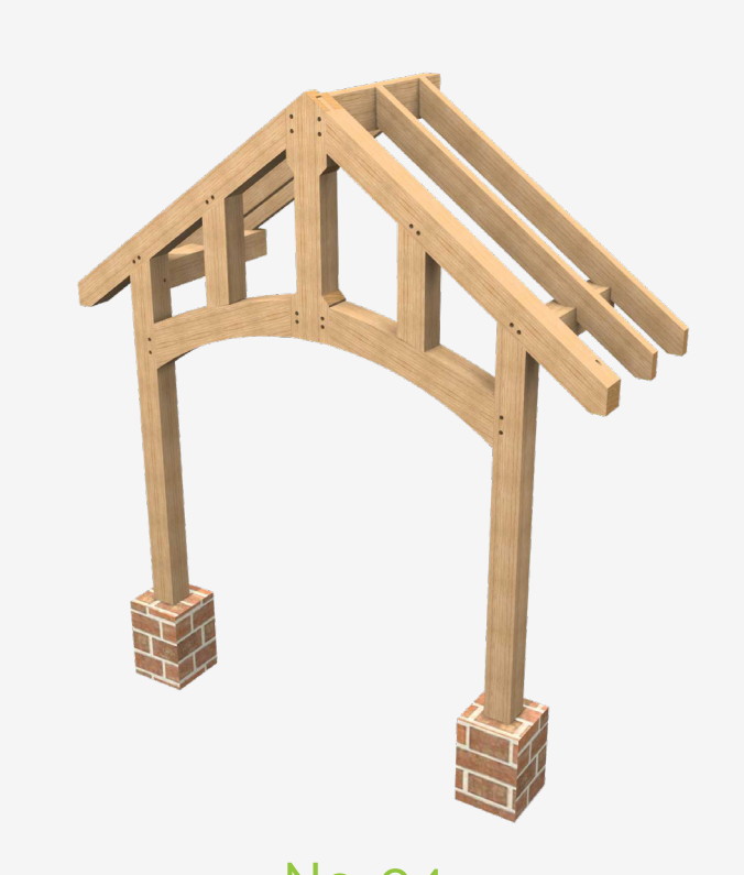
No. 04 d 959 x w 2225 x h 3200 £2,400 + VAT