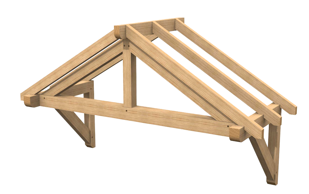
No. 18 d 900 x w 2380 x h 1564 £1,450 + VAT