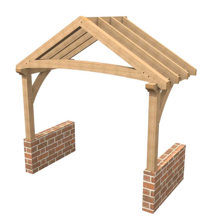
No. 09 d 1500 x w 3000 x h 3223 f2,100 + VAT