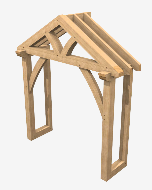
No. 15 d 675 x w 2310 x h 2823 f2,360 + VAT