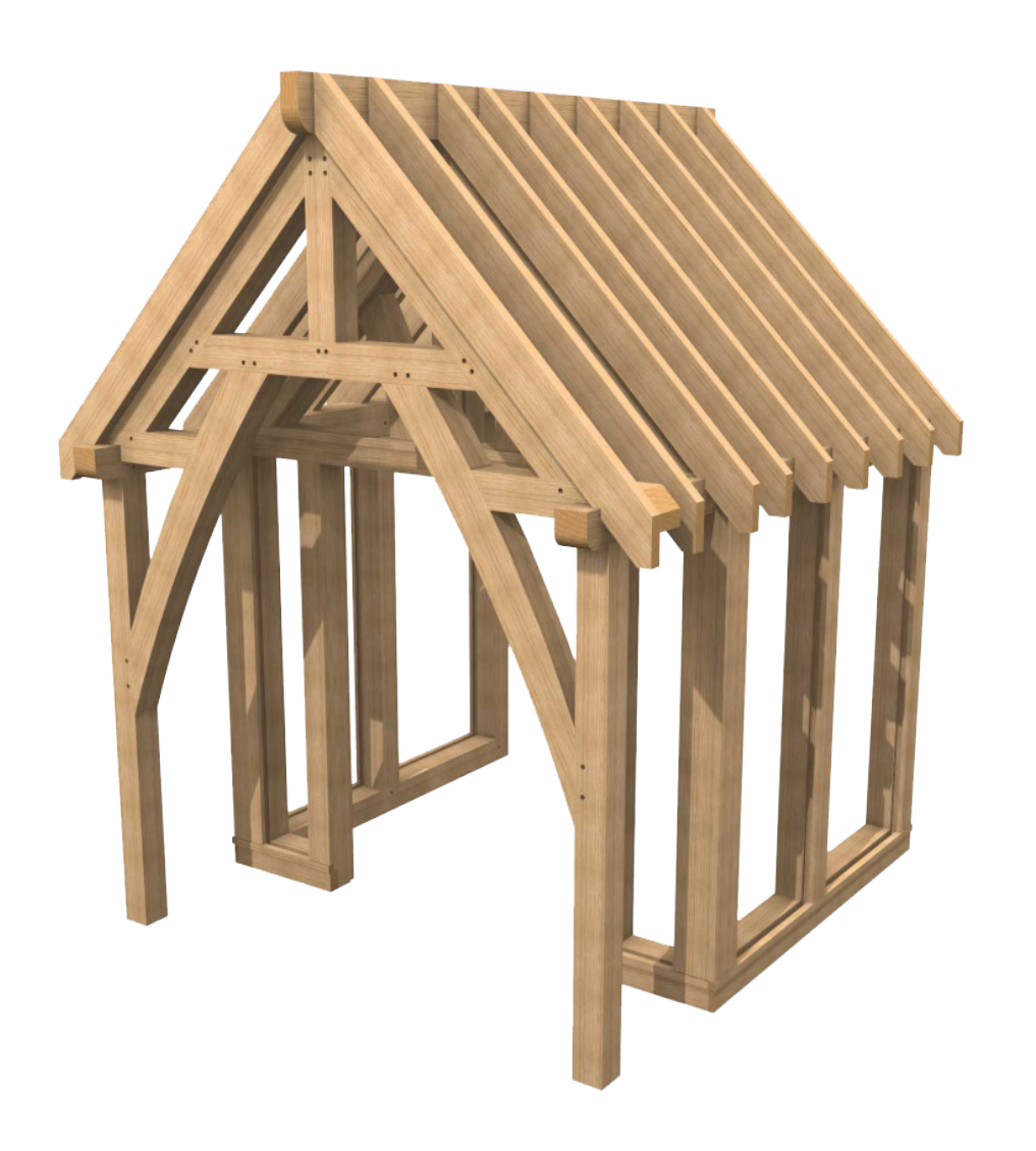
No. 11 d 3000 x w 2700 x h 3795 £8,400 + VAT