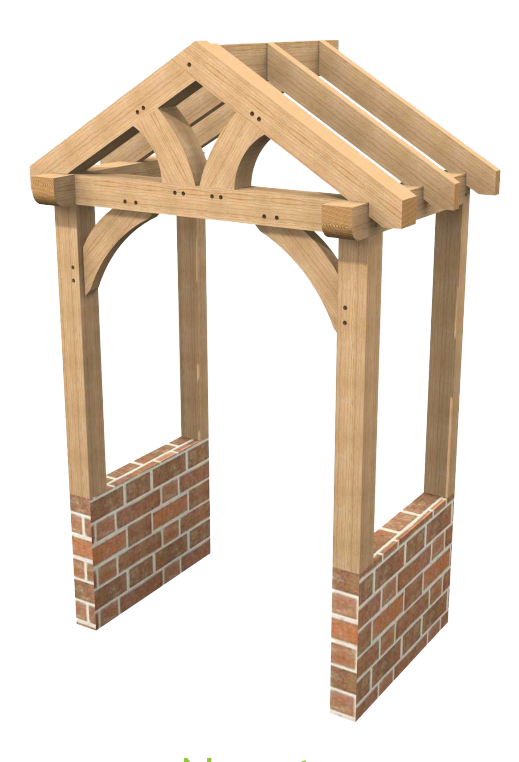
No. 16 d 1100 x w 1730 x h 3000 f1,965 + VAT