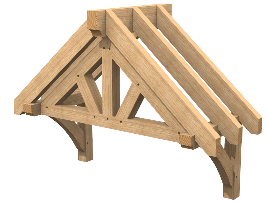
No. 17 d 600 x w 1500 f1,400 + VAT