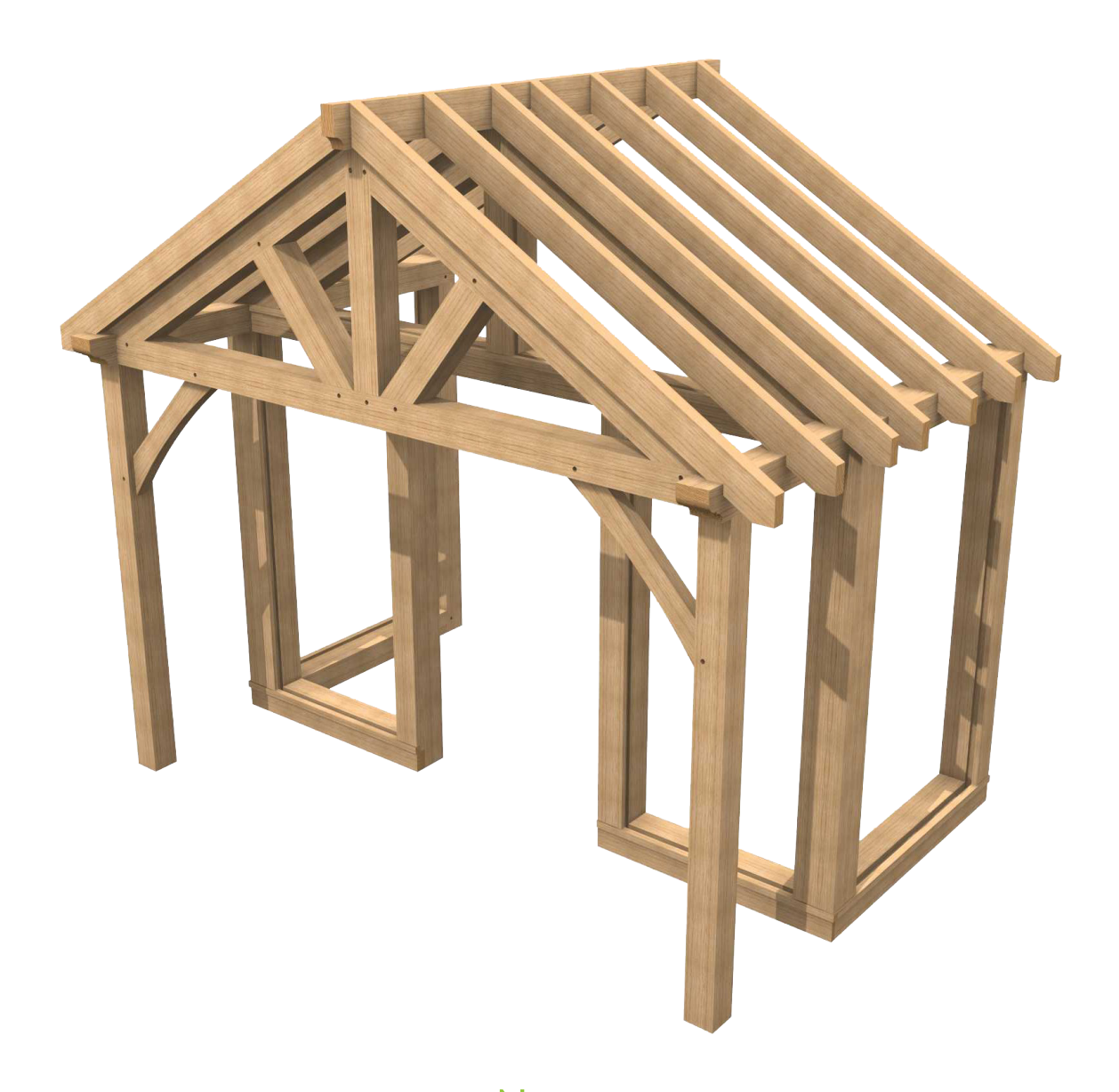
No. 07 d 2400 x w 3590 x h 3398 £6,900 + VAT