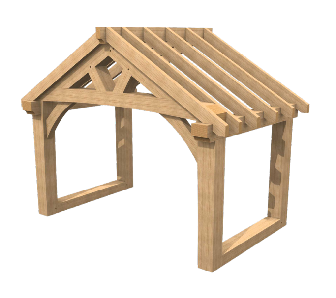
No. 13 d 1910 x w 2940 x h 2700 £4,255 + VAT