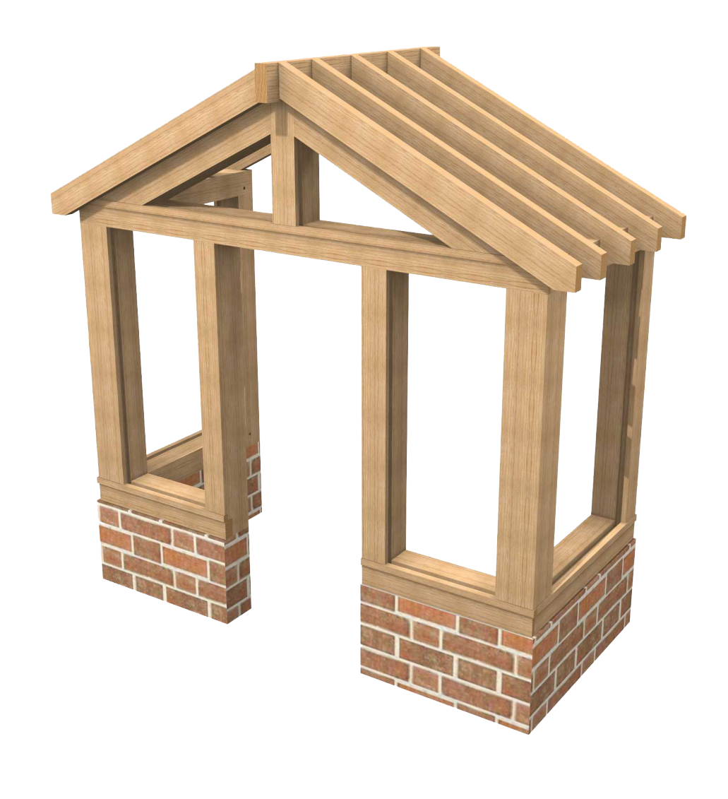
No. 10 d 1200 x w 2700 x h 3000 £4,500 + VAT