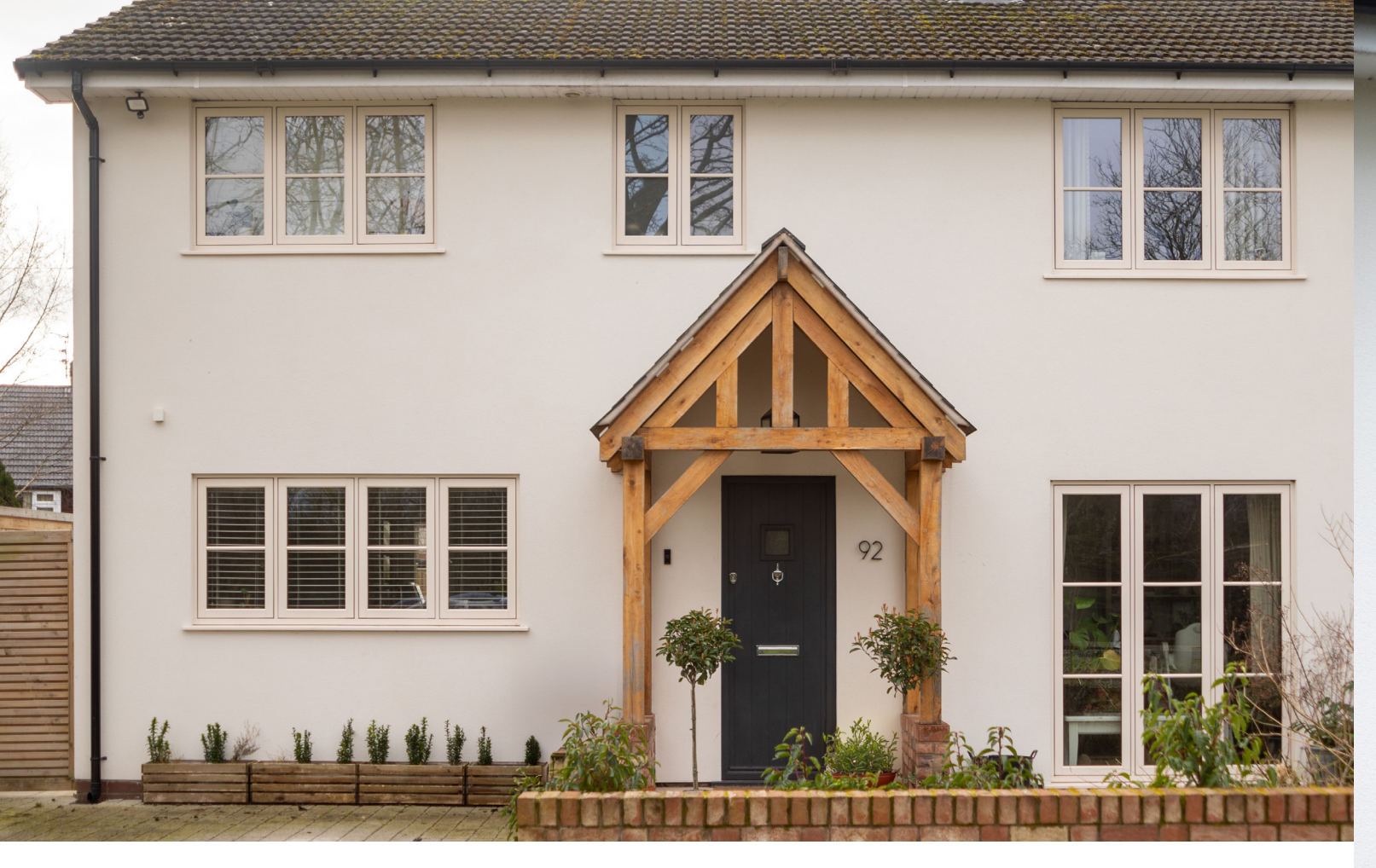
No. 01 d 1245 x w 2090 x h 3535 f2,200 + VAT