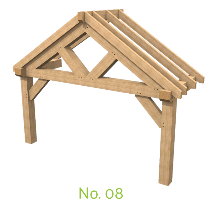
d 1200 x w 3580 x h 3026 £2,800 + VAT