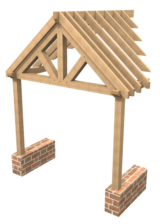
No. 03 d 1200 x w 2850 x h 3822 £2,550 + VAT