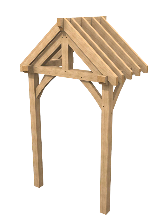
No. 02 d 1200 x w 1780 x h 3403 £2,240 + VAT