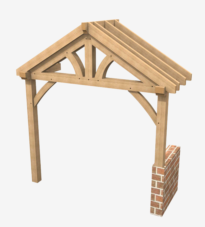
No. 05 d 1018 x w 2757 x h 3142 £2,350 + VAT