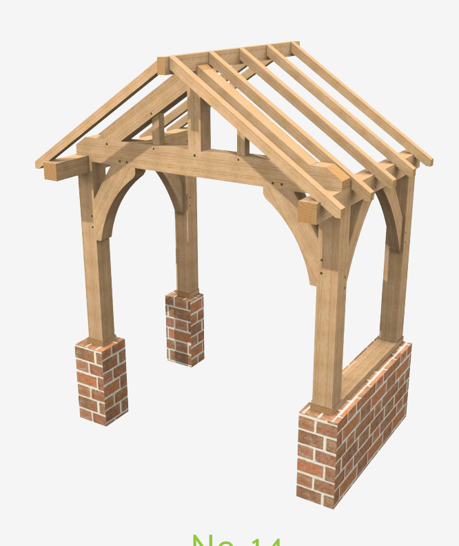
No. 14 d 1570 x w 2482 x h 3348 f3,800 + VAT